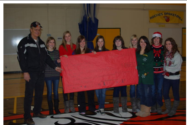
Coins for Christmas donation by members of our Student Union.